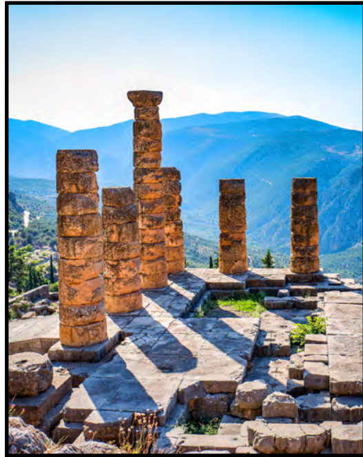
Ruins of the ancient Temple of Apollo at Delphi, overlooking the valley of Phocis.

How can your actions have a greater impact further down the path?