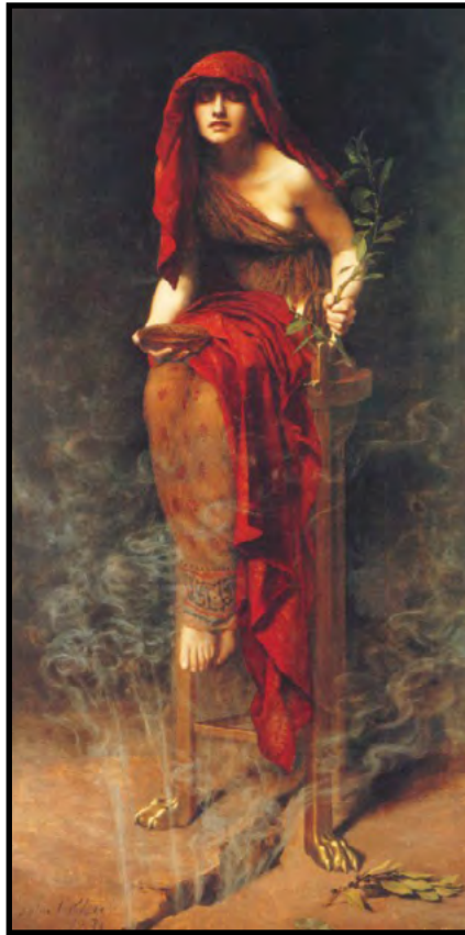
John Collier, Priestess of Delphi, 1891.

war on the Persians, she had said – if you do, you will destroy a mighty empire. She said that this was true, but he never asked the second, and more important question, which would have been – which empire? It proved to be Croesus's.