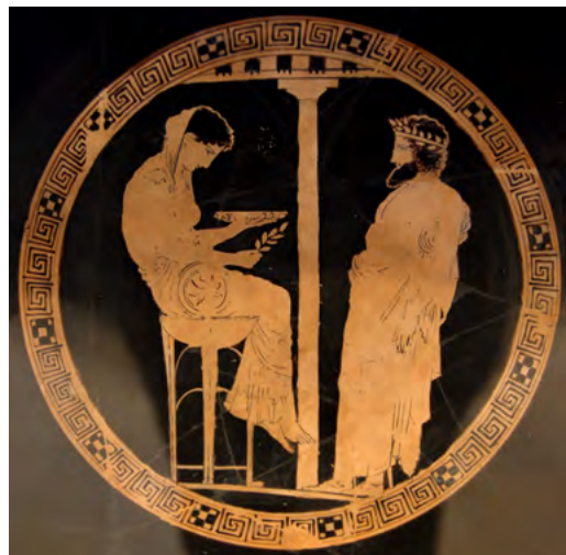
Aegeus, the mythical king who founded Athens, consults the Oracle, on a plate from ca. 440 BCE..

After his defeat and eventual release, Croesus sent his representative back to the Oracle to ask where her error had been. She pointed out that when he had previously asked if Croesus should wage