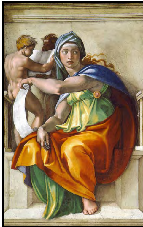
Michelangelo's depiction of the Delphic Sibyl on the Sistine Chapel ceiling.

For thousands of years the Oracles of Delphi were consulted before any major decision was made. Kings, generals, and philosophers all sought her advice.