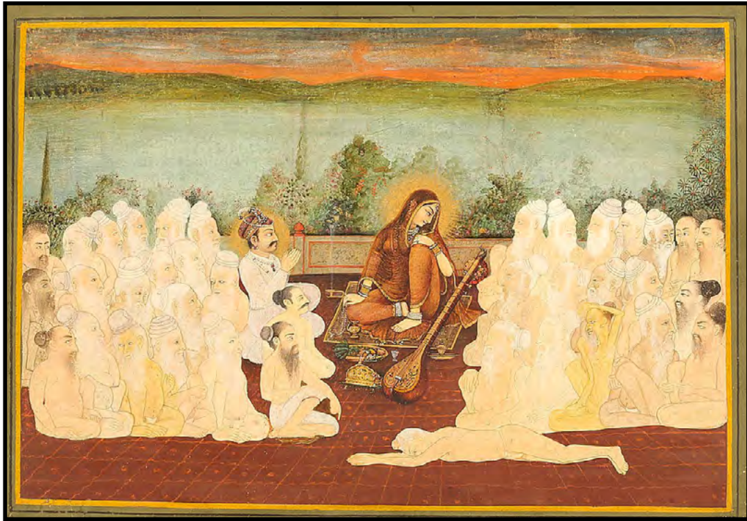
Mirabai surrounded by devotees, ca. eighteenth century.

Mirabai (ca. 1498–1550) is the most renowned woman poet-saint of India, her songs sung by Hindus, Muslims, and Sikhs alike. She was born a princess in the area of Rajasthan. Her great-grandfather founded the city of Jodhpur.