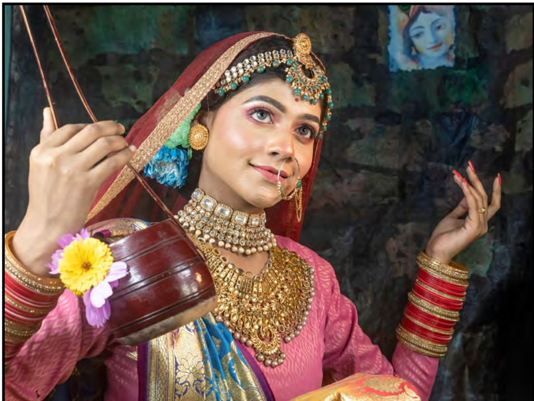
An actress in a play about Mirabai in India in 2022.

From the Penguin publication, Love Poems from God: Twelve Sacred Voices from the East and West , by Daniel Ladinsky, copyright 2002. www.danielladinsky.com . With permission.